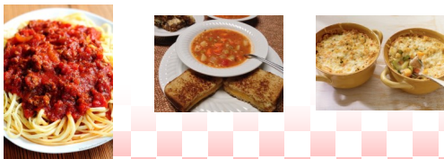
Plate: Grilled Cheese Sandwich with our homemade soup-of-the-day 5.99 Soup: Vegetable Beef or Pinto Beans & Cornbread Bowl: 3.99 Cup: 2.49