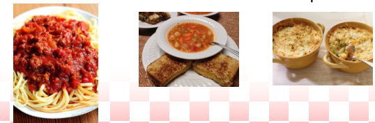
Plate: Grilled Cheese Sandwich with our homemade soup 5.99 Soup: Vegetable Beef or Pinto Beans & Cornbread Bowl: 3.99 Cup: 2.49